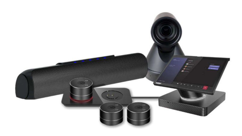
FALCON Wireless Video Conference