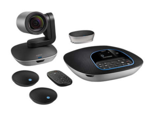
Logitech Video Conference Family